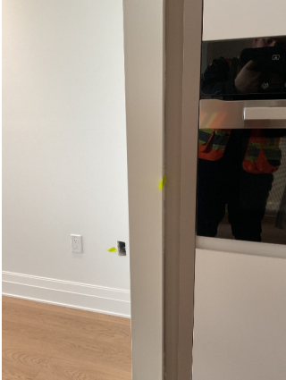
12468 - 1 - CABINETS~CLEAN PAINT ON CABINET