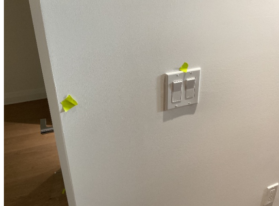
12456 - 2 - WALLS~TOUCH UP CORNER AND AROUND SWITCHES