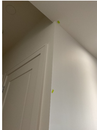
12458 - 1 - NOTE~POTLIGHT NEEDS TO BE FLUSH WITH CEILING