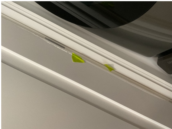
12444 - 1 - DOORS~TOUCH UP DOOR