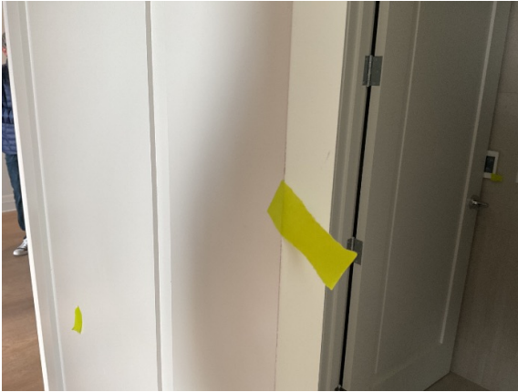
12456 - 1 - WALLS~TOUCH UP CORNER AND AROUND SWITCHES