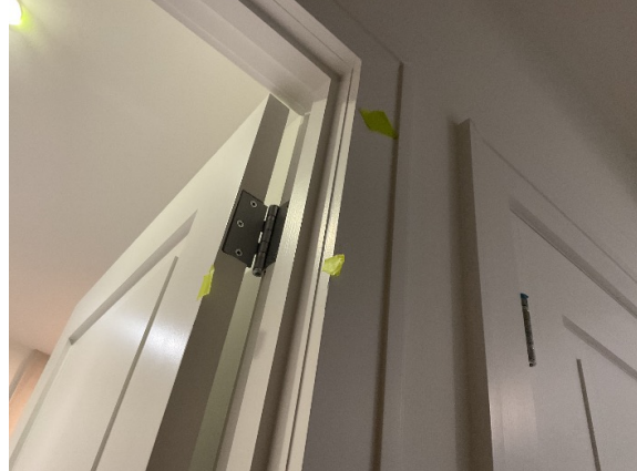
12432 - 1 - CEILING~TOUCH UP CORNER