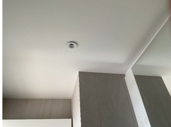
12448 - 1 - NOTE~NEEDS TOUCH UP ALL TRIM