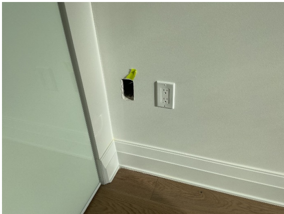
12451 - 1 - NOTE~TRIM NEEDS TOUCH UP