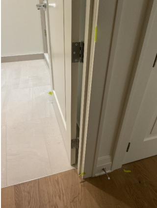
12431 - 2 - DOORS~TOUCH UP TRIMS, CLEAN FLOORS