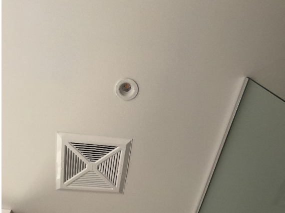
12445 - 2 - CEILING~PAINT ON POT LIGHT, OTHER POT LIGHT NOT FLUSH TO CEILING