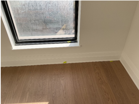
12448 - 2 - NOTE~NEEDS TOUCH UP ALL TRIM