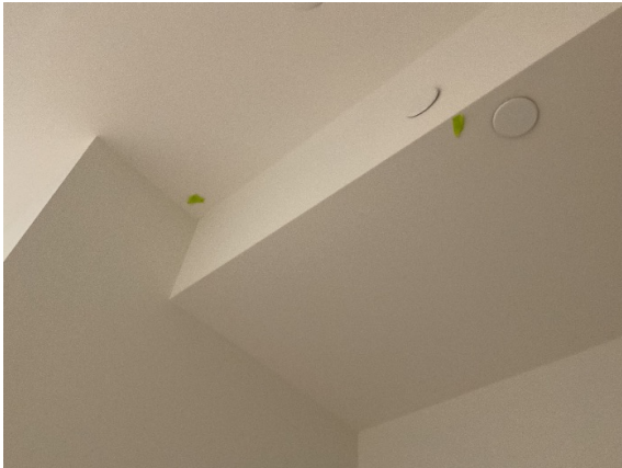
12433 - 1 - NOTE~CEILING AROUND VENT NEEDS TOUCH UP