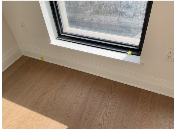
12449 - 1 - NOTE~WHAT IS THIS FOR?