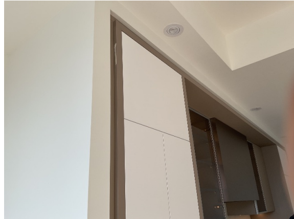
12471 - 1 - NOTE~TOUCH UP TRIM TO FRAME