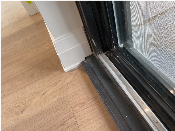
12476 - 1 - NOTE~TOUCH UP TRIM