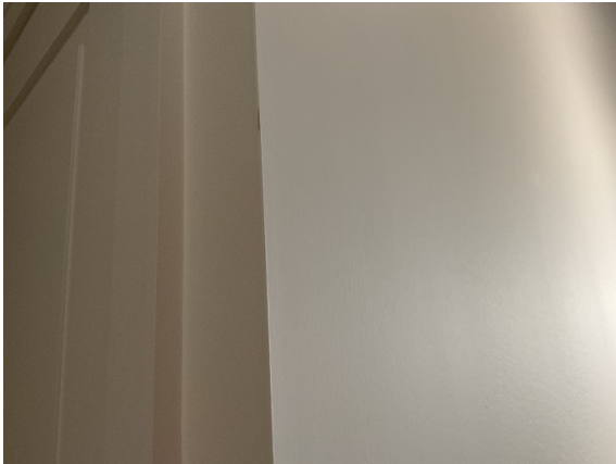
12456 - 3 - WALLS~TOUCH UP CORNER AND AROUND SWITCHES