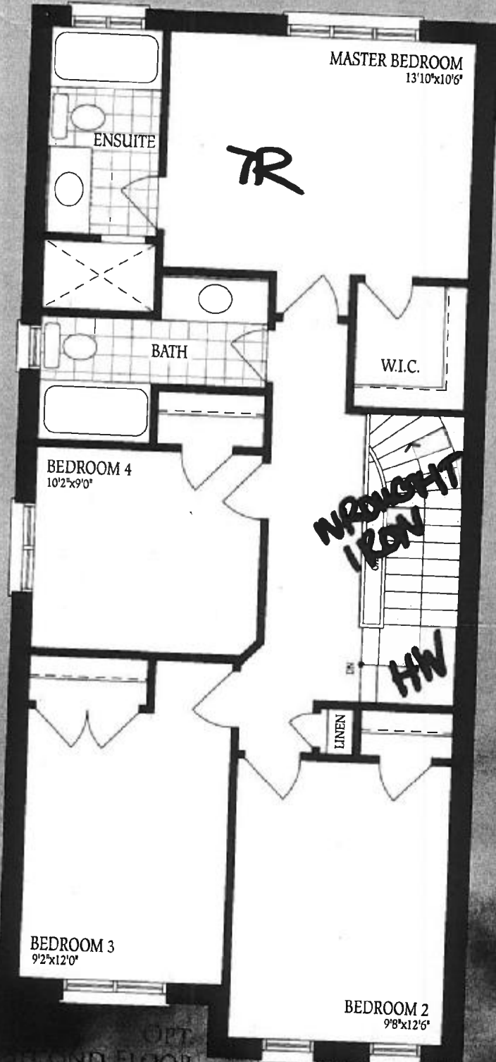
OPT. SECOND FLOOR 4 BEDROOM ELEV. A