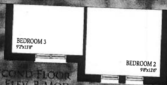
SECOND FLOOR ELEV. B MOD