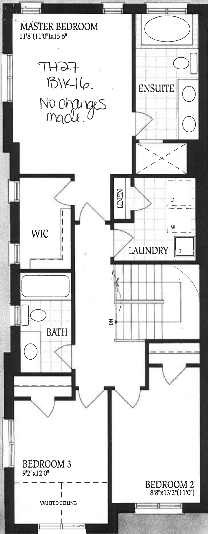
SECOND FLOOR ELEV. A