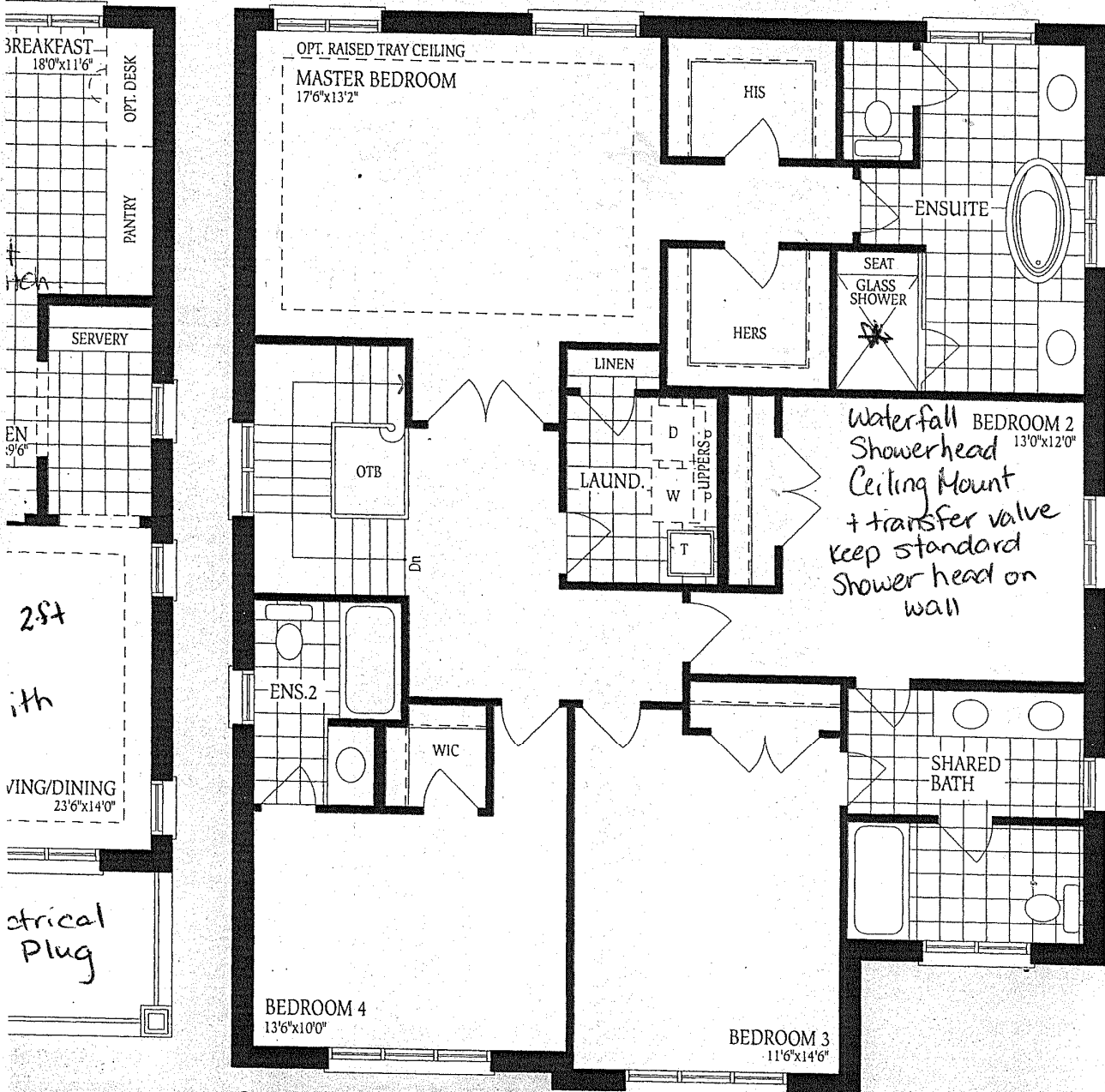
Second Floor Elevation A