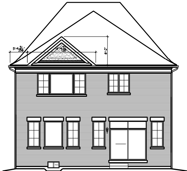
LOT NUMBER: 46 UNIT NAME: FORESTVIEW ELEVATION: REAR UPG. B (REV) UNIT NUMBER: 4206