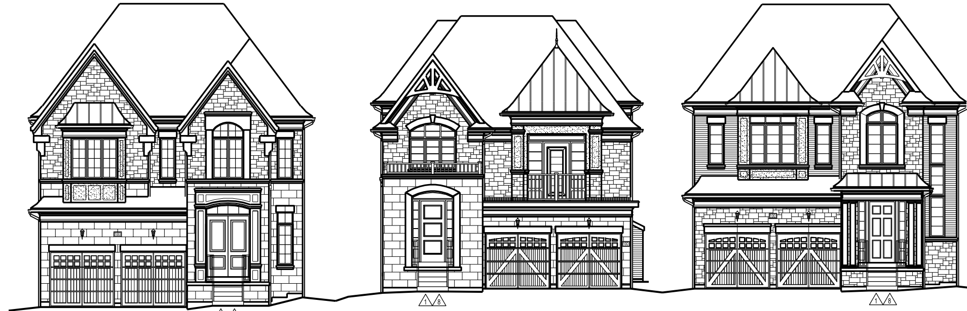
LOT NUMBER: 44 UNIT NAME: FORESTCREST ELEVATION: A(REV) UNIT NUMBER: 4203