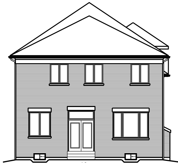
LOT NUMBER: 48 UNIT NAME: BROOKSIDE ELEVATION: REAR UPG. C (REV) UNIT NUMBER: 4003

It is the builder's complete responsibility to ensure that all plans submitted for approval fully comply with the Architectural Guidelines and all applicable regulations and requirements including zoning provisions and any provisions in the subdivision agreement. The Control Architect is not responsible in any way for examining or approving site (lotting) plans or working drawings with respect to any zoning or building code or permit matter or that any house can be properly built or located on its lot. This is to certify that these plans comply with the applicable Architectural Design Guidelines approved by the City of VAUGHAN.