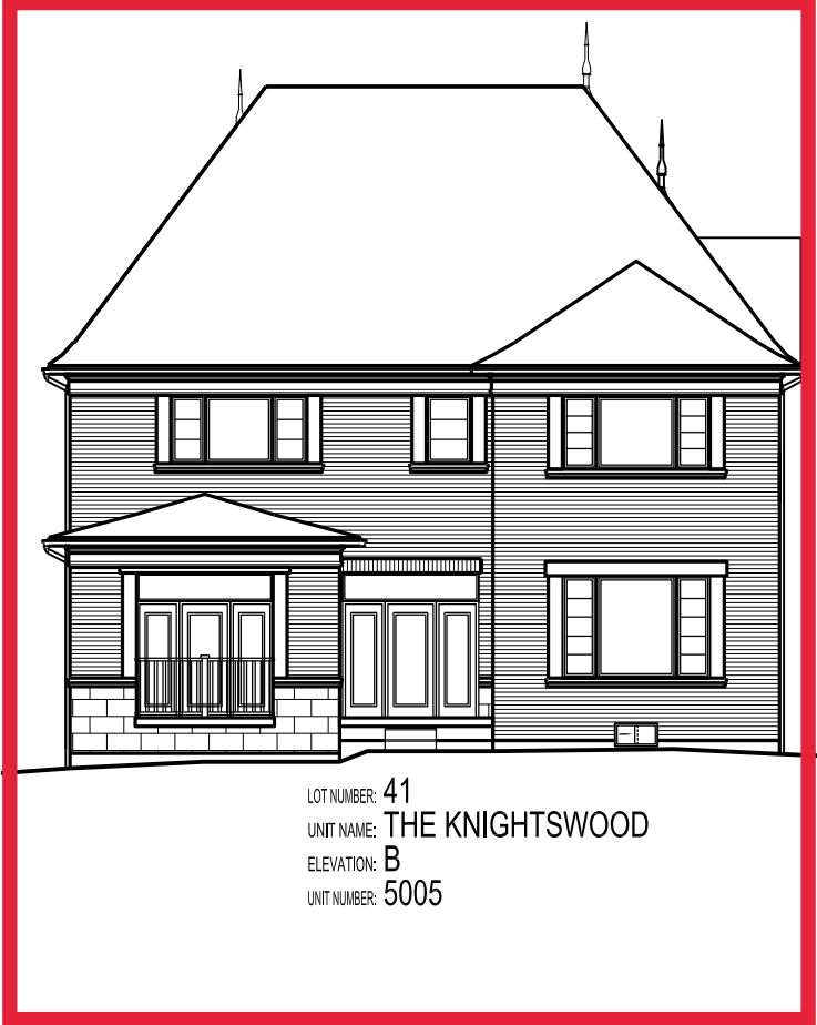
LOT NUMBER: 41 UNIT NAME: THE KNIGHTSWOOD ELEVATION: B UNIT NUMBER: 5005