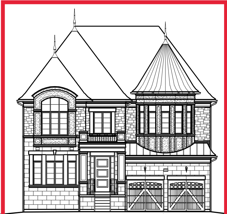
LOT NUMBER: 41 UNIT NAME: THE KNIGHTSWOOD ELEVATION: B UNIT NUMBER: 5005

ensure that all plans submitted for approval fully comply with the Architectural Guidelines and all applicable regulations and requirements including zoning provisions and any provisions in the subdivision agreement. The Control Architect is not responsible in any way for examining or approving site (lotting) plans or working drawings with respect to any zoning or building code or permit matter or that any house can be properly built or located on its lot. This is to certify that these plans comply with the applicable Architectural Design Guidelines approved by the City of VAUGHAN.