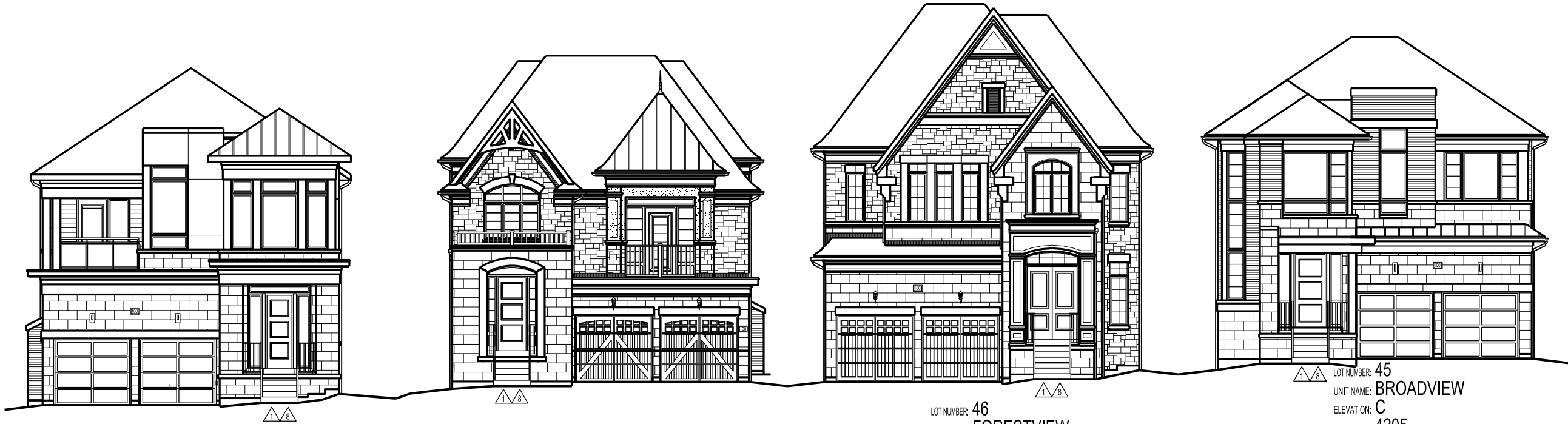
LOT NUMBER: 48 UNIT NAME: BROOKSIDE ELEVATION: C(REV) UNIT NUMBER: 4003