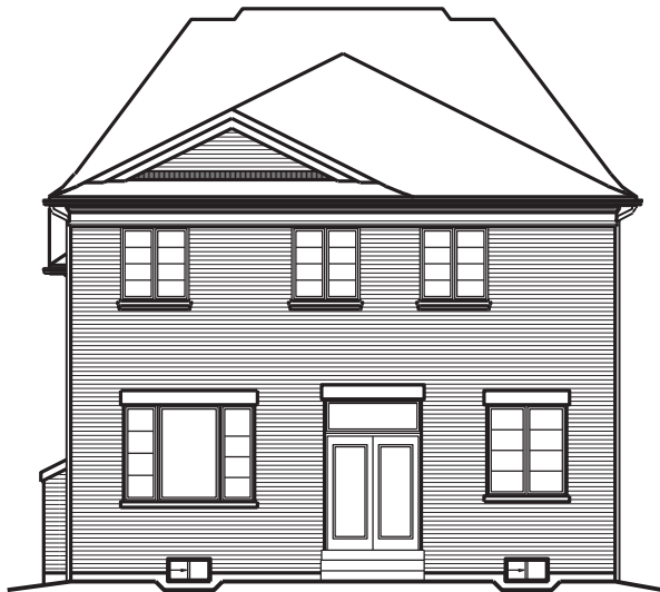
LOT NUMBER: 47 UNIT NAME: BROOKSIDE ELEVATION: REAR UPG. B UNIT NUMBER: 4003