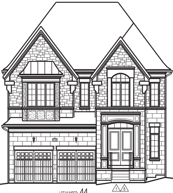
LOT NUMBER: 44 UNIT NAME: FORESTCREST ELEVATION: A(REV) UNIT NUMBER: 4203