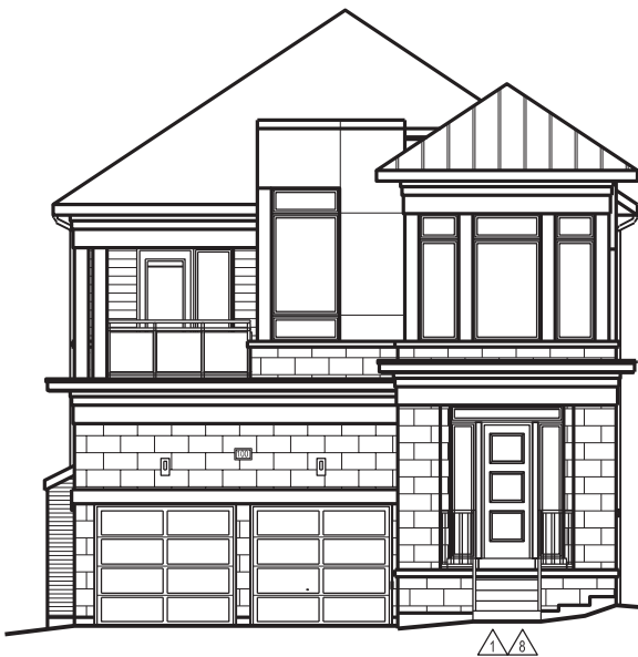
LOT NUMBER: 48 UNIT NAME: BROOKSIDE ELEVATION: C(REV) UNIT NUMBER: 4003