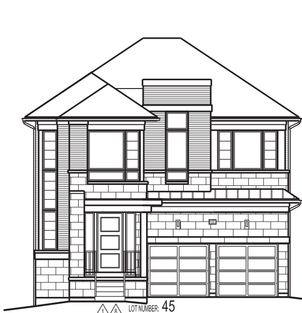
LOT NUMBER: 45 UNIT NAME: BROADVIEW ELEVATION: C UNIT NUMBER: 4205