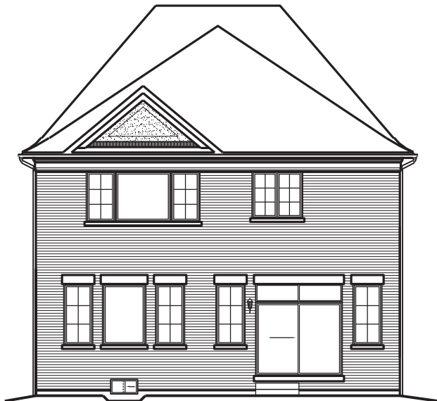
LOT NUMBER: 46 UNIT NAME: FORESTVIEW ELEVATION: REAR UPG. B (REV) UNIT NUMBER: 4206