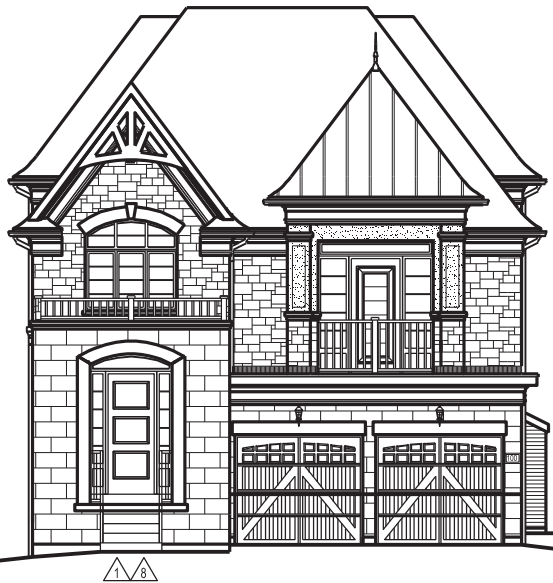
LOT NUMBER: 47 UNIT NAME: BROOKSIDE ELEVATION: B UNIT NUMBER: 4003