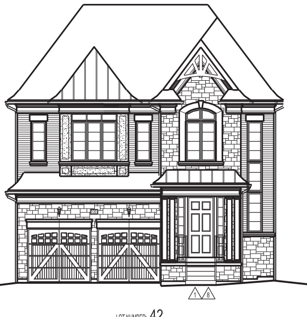
LOT NUMBER: 42 UNIT NAME: BROADVIEW ELEVATION: B (REV) UNIT NUMBER: 4205