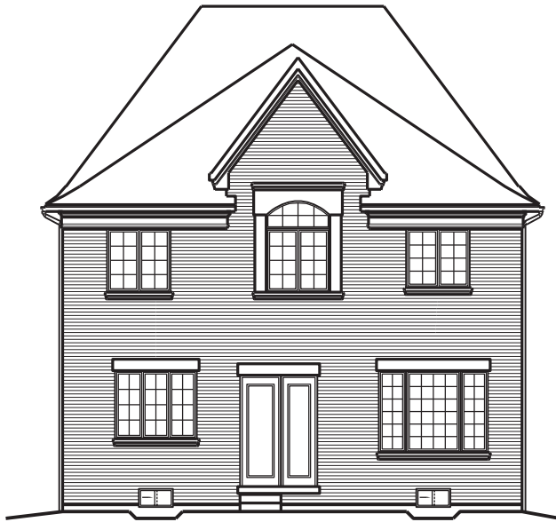
LOT NUMBER: 44 UNIT NAME: FORESTCREST ELEVATION: REAR UPG. A (REV) UNIT NUMBER: 4203