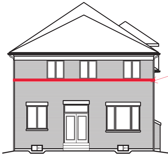
LOT NUMBER: 48 UNIT NAME: BROOKSIDE ELEVATION: REAR UPG. C (REV) UNIT NUMBER: 4003