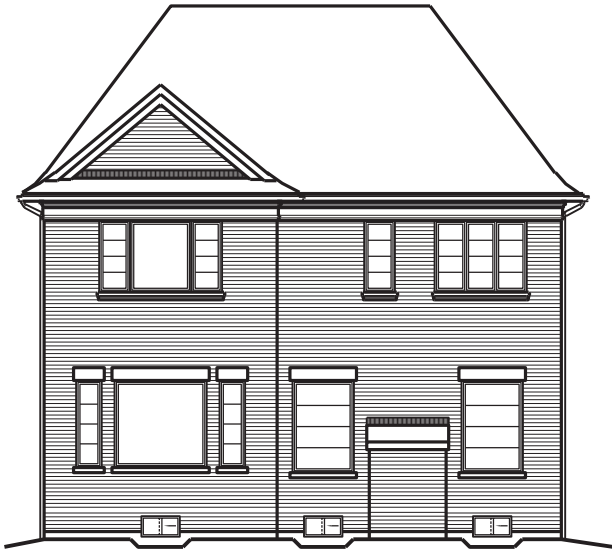
LOT NUMBER: 42 UNIT NAME: BROADVIEW ELEVATION: REAR UPG. B (REV) UNIT NUMBER: 4205