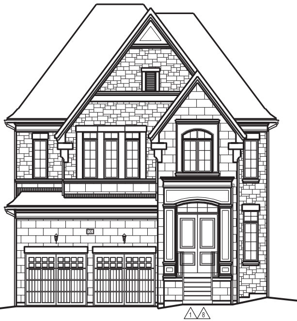
LOT NUMBER: 46 UNIT NAME: FORESTVIEW ELEVATION: B(REV) UNIT NUMBER: 4206

1 BRICK/ STONE VENEER ON SIDES OF STAIRS (POURED OR "BRICK LEDGE" PRECAST)