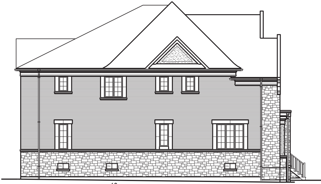
LOT NUMBER: 49 UNIT NAME: ASPEN ELEVATION: SIDE UPG. A UNIT NUMBER: 5009MOD-LOT 49