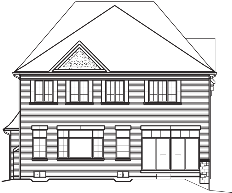
LOT NUMBER: 49 UNIT NAME: ASPEN ELEVATION: REAR UPG. A UNIT NUMBER: 5009MOD-LOT 49