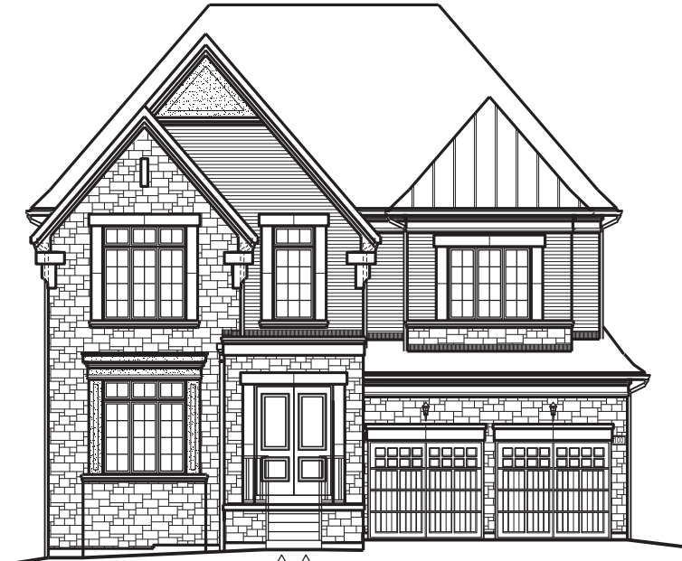
LOT NUMBER: 49 UNIT NAME: ASPEN ELEVATION: A UNIT NUMBER: 5009MOD-LOT 49