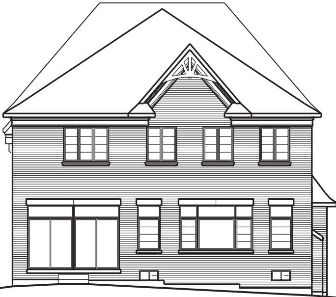
LOT NUMBER: 52 UNIT NAME: ASPEN ELEVATION: REAR B UPG. UNIT NUMBER: 5009