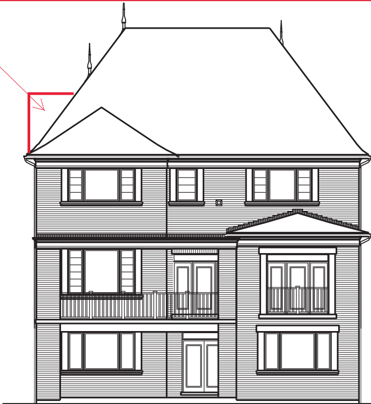
LOT NUMBER: 54 UNIT NAME: THE KNIGHTSWOOD ELEVATION: REAR B UPG. (REV) UNIT NUMBER: 5005