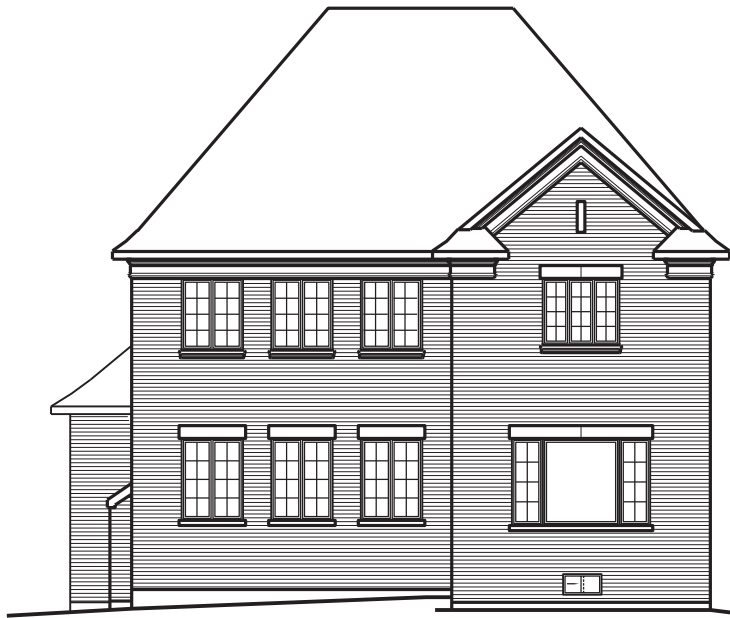
LOT NUMBER: 51 UNIT NAME: BIRCHWOOD ELEVATION: REAR A UPG. UNIT NUMBER: 5008