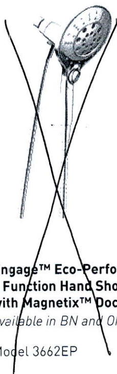
Engage™ Eco-Performance 6 Function Hand Shower with Magnetix™ Docking Available in BN and ORB Model 3662EP