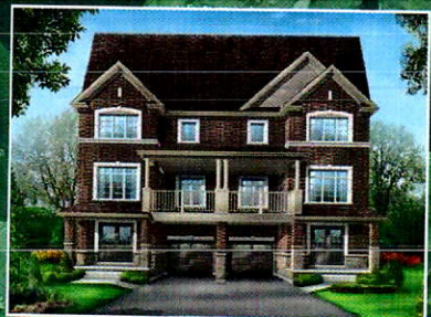
ELEVATION 2 & 2A