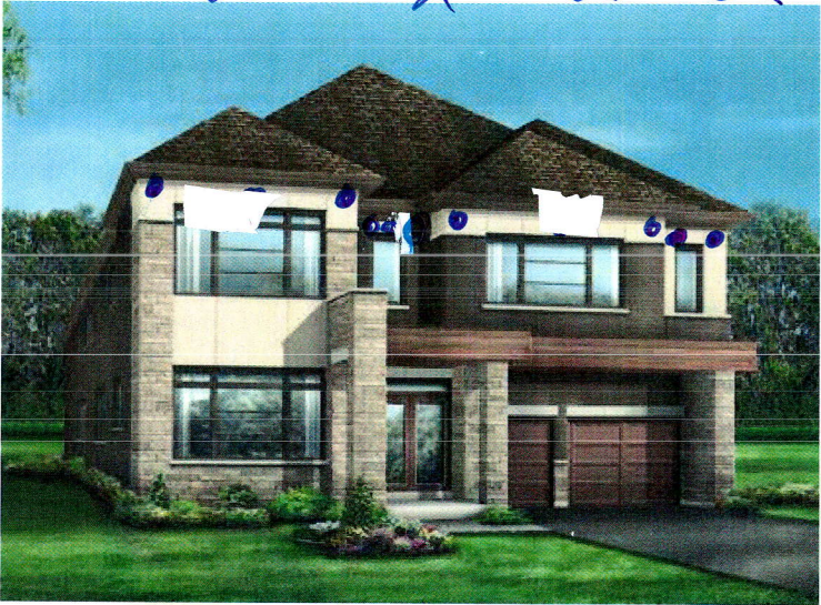
ELEVATION 3 • 3,720 sq.ft.