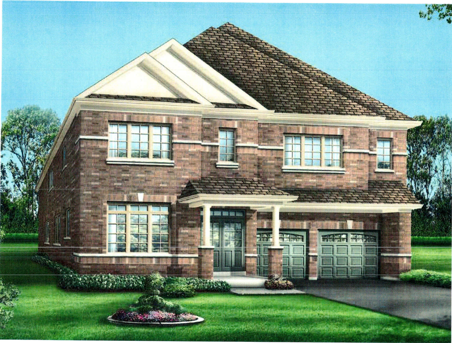
ELEVATION 1 • 3,705 sq.ft.