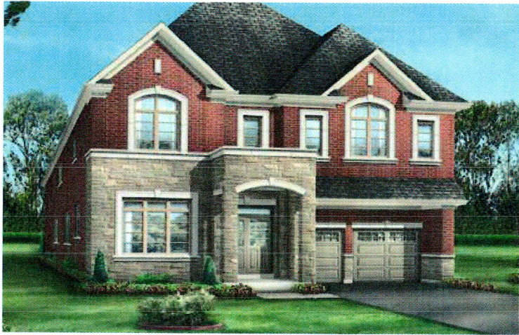
ELEVATION 2 • 3,744 sq.ft.