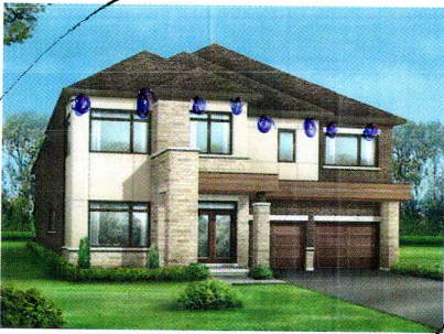
ELEVATION 3 • 3,487 sq.ft.

Orientation of home may be reversed and purchaser agrees to accept same. Steps and porches may vary at any exterior entrance ways due to grading variance. Actual usable floor space may vary from the stated floor areas. All renderings are artist's concept. Dimensions, specifications and architectural detailing subject to modifications. Roofline and adjoining model types may vary due to siting. E. & O.E. May 2021