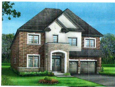
ELEVATION 2 • 3,502 sq.ft.