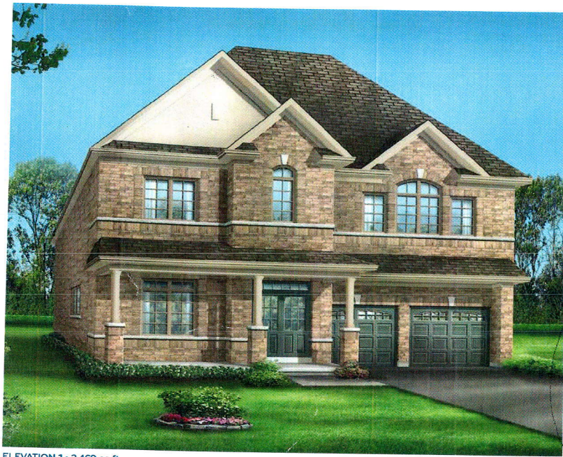
ELEVATION 1 • 3,469 sq.ft.