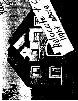
ELEVATION 2 • 3,502 sq.ft.