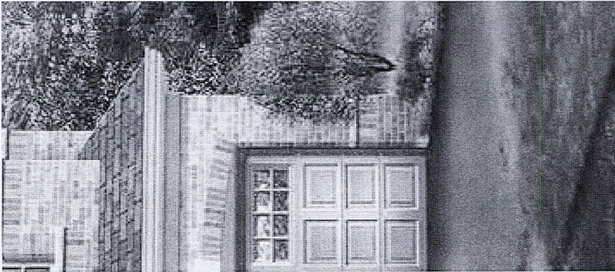
ELEVATION 2 • 2,773 sq.ft.