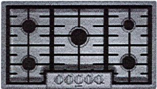
NGM8656UC Stainless Steel

Also available in: Black w/Black NGM8646UC Stainless Knobs