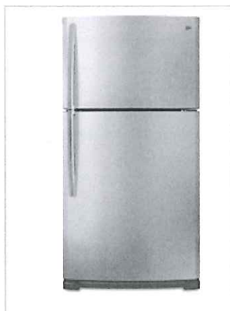
Monochromatic Stainless Steel | M9RXDGFYM