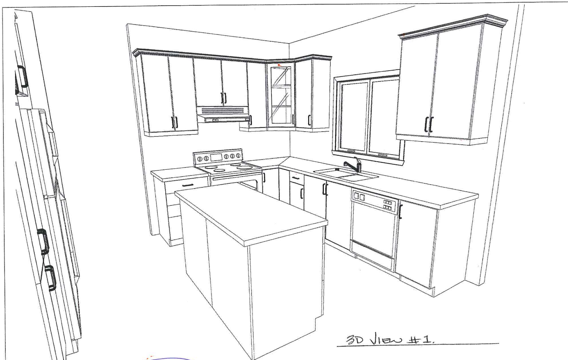
3D View #1.

I have reviewed these drawings and understand the details of the layout and the Cartier Kitchens specifications.