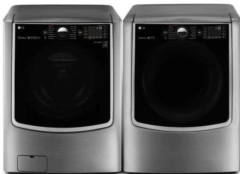
LG 6.0 Cu. Ft. Front-Load Steam Washer and 9.0 Cu. Ft. Electric Dryer – Graphite Steel