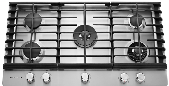
KitchenAid 36" 5-Burner Gas Cooktop with Griddle - KCGS956ESS (/products/kitchenaid-