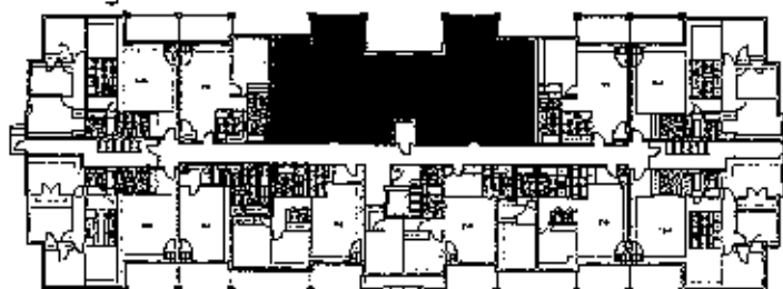
Building A All Floors