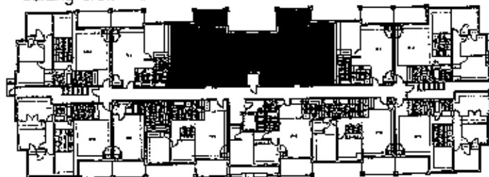
Building A All floors