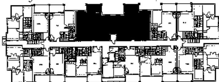
Building A All Floors