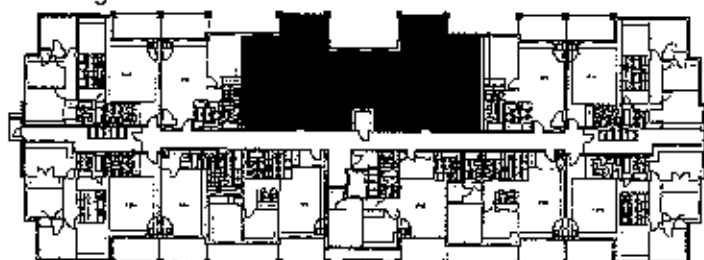
Building A All Floors