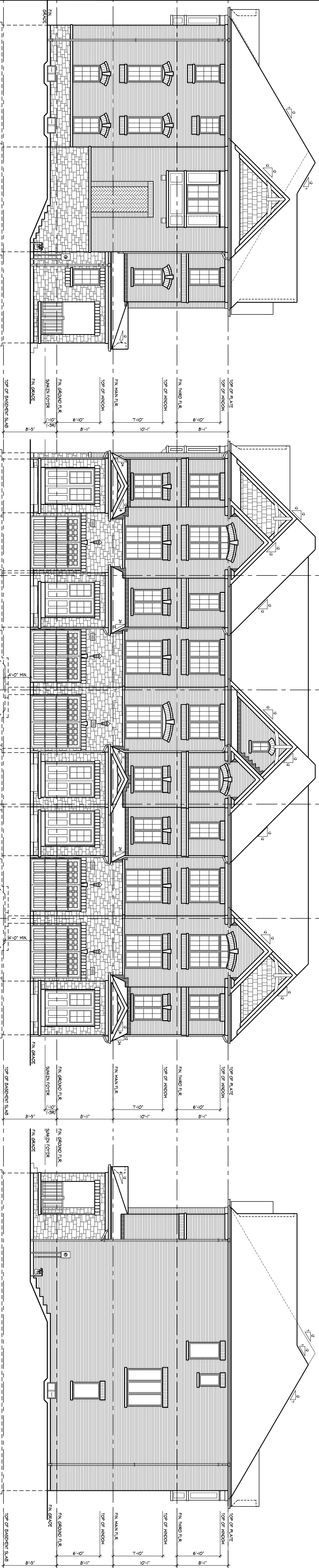
804 EL. 'A' - CORNER