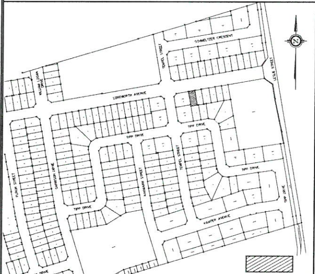
N.T.S. KEY MAP Subject LOT

W Architect Inc. DESIGN CONTROL REVIEW AUG. 09, 2021 FINAL BY: MMI This stamp is only for the purposes of design control and carries no other professional obligations.