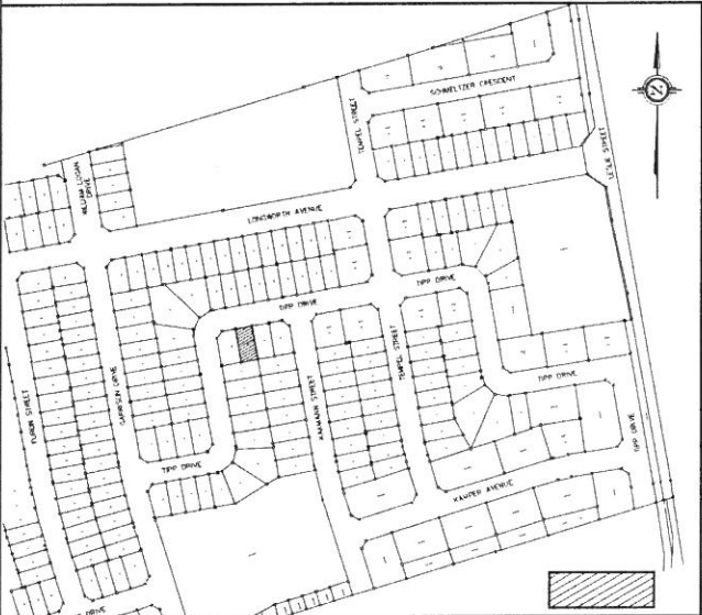
N.T.S. KEY MAP Subject LOT

Richmond Hill City of Richmond Hill Building Division ZONING REVIEWED Initials: BH