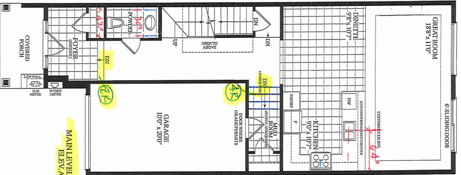
MAIN LEVEL ELEV. A