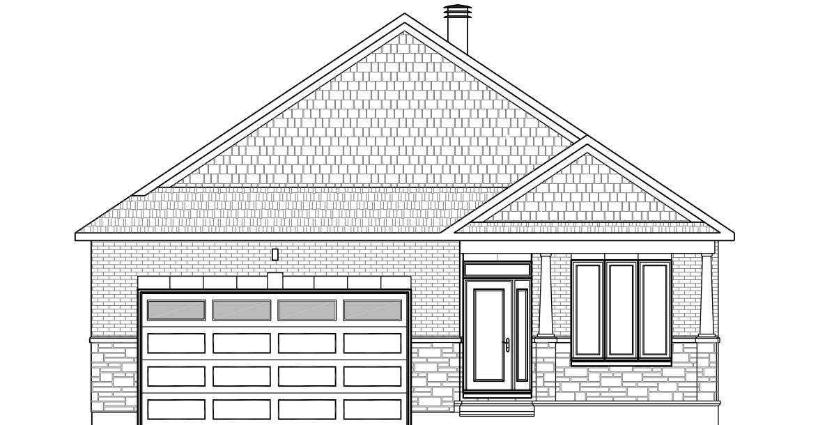
CUSTOM ELEVATION A - LOT 15 SV

Site: Shea Village PH1 Plan No: Refer to Draft Site Plan Lot: SV PH1 15 Date: January 24, 2024