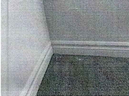
149056 - 2 - FLOORING~CARPET LIFTING LEFT OF WINDOW AND INSIDE CLOSET AND BEDROOM TOO CARPET