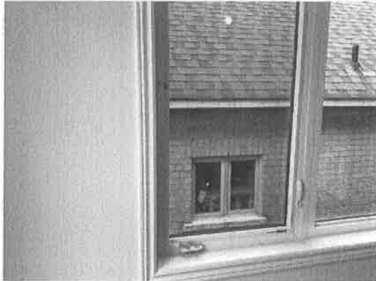
150127 - 2 - WINDOWS~BOWED SCREEN RIGHT OF BALCONY DOOR 2) INSTALL BALCONY SCREEN