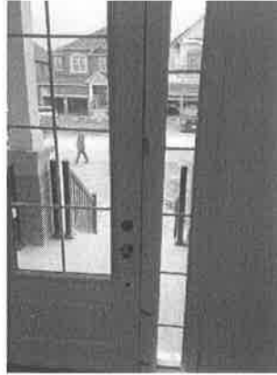
150127 - 1 - WINDOWS~BOWED SCREEN RIGHT OF BALCONY DOOR 2) INSTALL BALCONY SCREEN