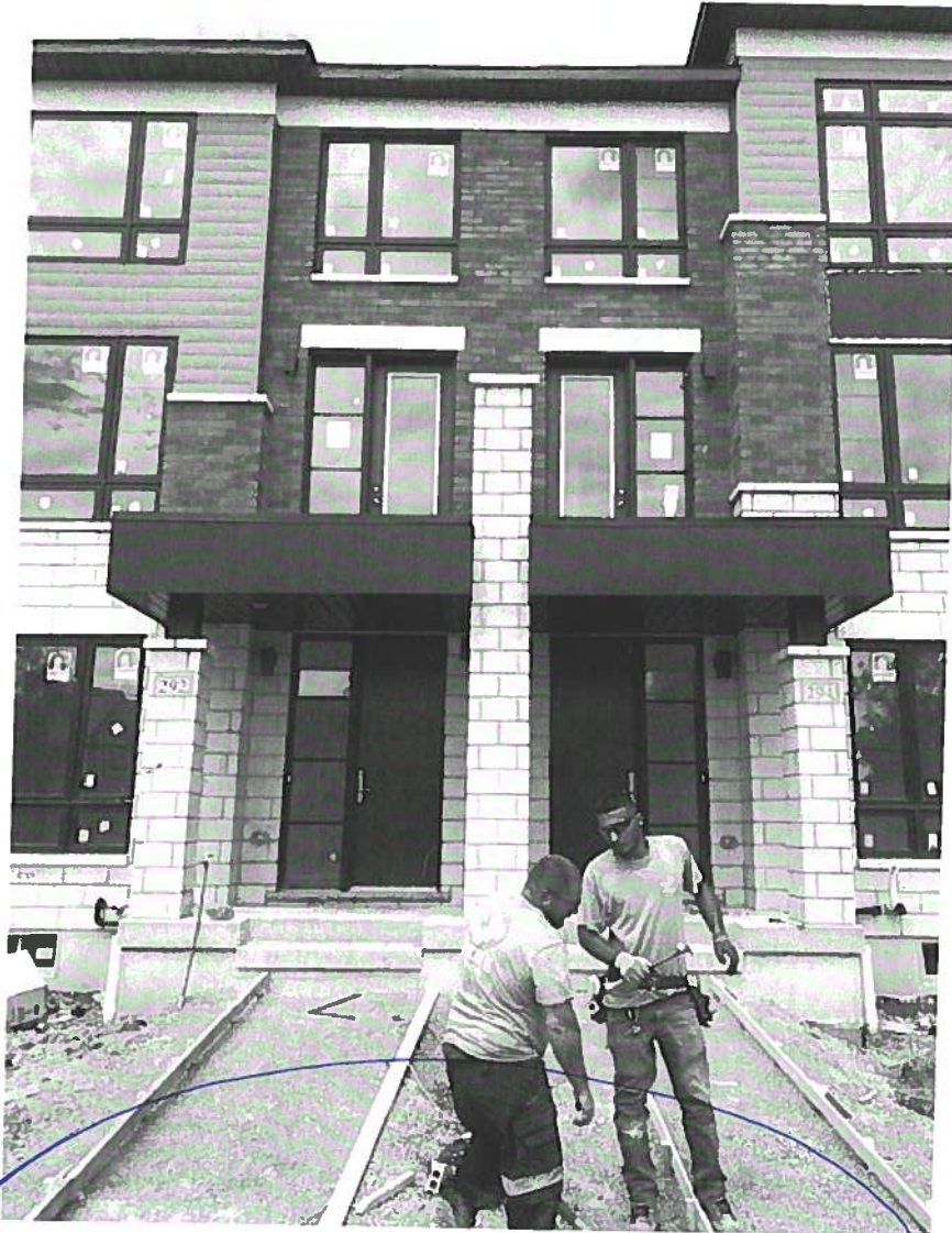
Blk#9 Units#56 & 57 rears remove 1 course from each columns: