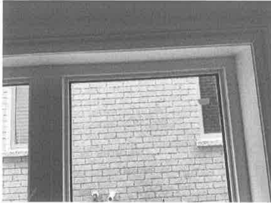
150052 - 1 - FRONT DOORS~LARGE GAP LEFT DOOR