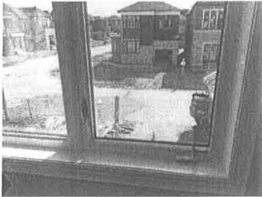
150221 - 1 - WINDOWS~ADJUST OPERATING WINDOW - DOES NOT LATCH AT TOP