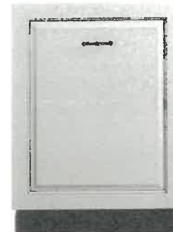
24" Dishwasher (Panel Ready) GBT412SIM1