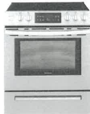
30" Range, Smooth top Frigidaire CFEH3054U