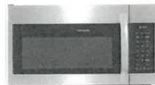
30" Over The Range Microwave Frigidaire FFMV1846VS