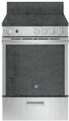
24" Range, Smooth top GE – JCAS640RMSS