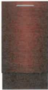
24" 18" Dishwasher (Panel Ready) UDT518SAHP