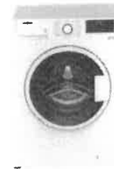
24" Washer WM7200WW