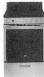
24" Range, Smooth top GE - JCAS640RMSS