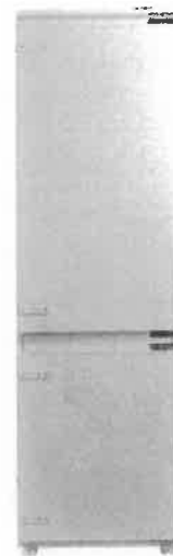
24" Fridge (Panel Ready) GE - M2E9FPMKII