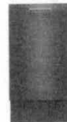
24" Dishwasher (Panel Ready) UDT518SAHP