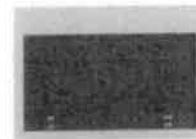
24" Over The Range Microwave Haier HMV1472BHS