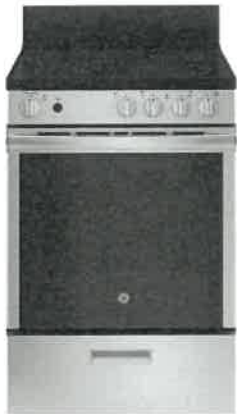
24" Range, Smooth top GE – JCAS640RMSS