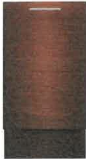
24" Dishwasher (Panel Ready) UDT518SAHP