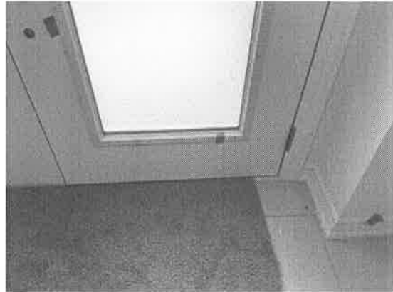
151421 - 1 - NOTE:~DENT ON MAIN DOOR ENTRANCE FROM GARAGE