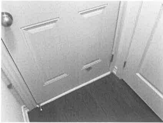
151419 - 1 - FRONT DOORS~CHIP ON FRONT DOOR ASTRICAL