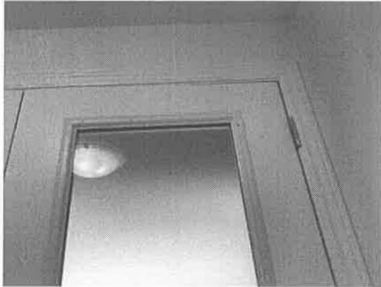
151420 - 2 - FRONT DOORS~SCREW COVERS MISSING AT FRONT DOOR