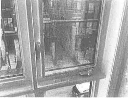
150716 - 1 - NOTE:~SLIDING DOOR SCREEN NOT WORKING AT REAR BALCONY