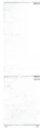
24" Fridge (Panel Ready) GE M2E9FPMKII