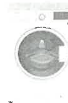
24" Washer WM7200WW