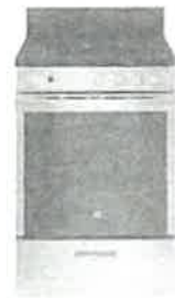
24" Range, Smooth top GE - JCA5640RMSS