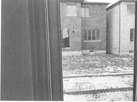
152299 - 1 - WINDOWS~SCRATCH ON UPPER RIGHT FIXED GLASS ABOVE OPERATING AT BED ROOM ABOVE PORCH