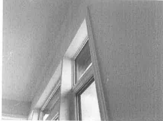
152307 - 1 - WINDOWS~SMALL CHIP AT UPPER LEFT CORNER FIXED WINDOW