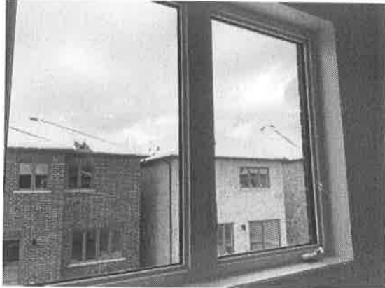
152315 - 1 - FRONT DOORS~ADJUST OPERATING DOOR