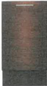
(Panel Ready) UDT518SAHP