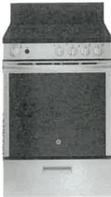
24" Range, Smooth top GE – JCAS640RMSS