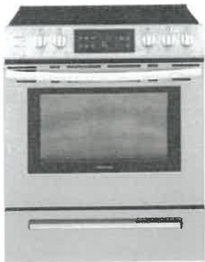
30" Range, Smooth top Frigidaire CFEH3054U