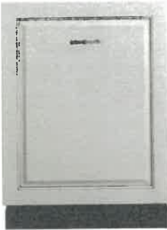
24" Dishwasher (Panel Ready) GBT412SIM1