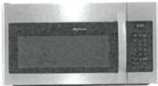
30" Over The Range Microwave Frigidaire FFMV1846VS