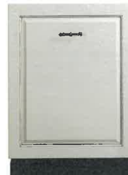
24" Dishwasher (Panel Ready) GBT412SIM1