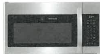
30" Over The Range Microwave Frigidaire FFMV1846VS