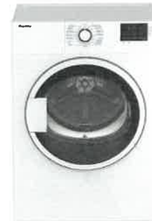
24" Dryer DV7600WW