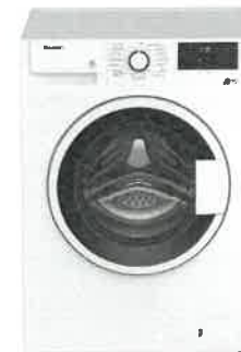
24" Washer WM7200WW