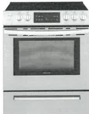
30" Range, Smooth top Frigidaire CFEH3054U