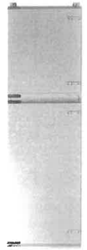
24" Fridge (Panel Ready) GE - M2E9FPMKII