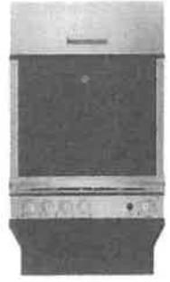
24" Range, Smooth top GE - JCA5640RMSS