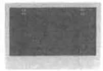
24" Over The Range Microwave Haier HMV1472BHS