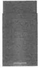
(Panel Ready) UDT518SAHP