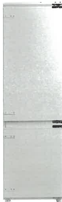
24" Fridge (Panel Ready) GE - M2E9FPMKII