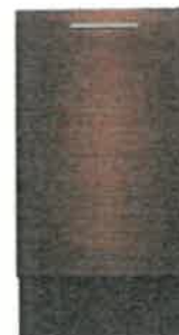
(Panel Ready) UDT518SAHP