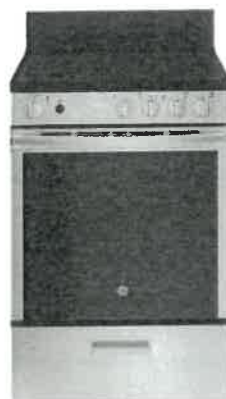
24" Range, Smooth top GE – JCAS640RMSS