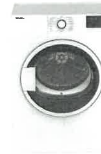
24" Dryer DV7600WW