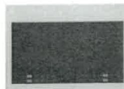
24" Over The Range Microwave Haier HMV1472BHS