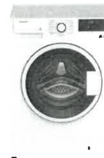
24" Washer WM7200WW