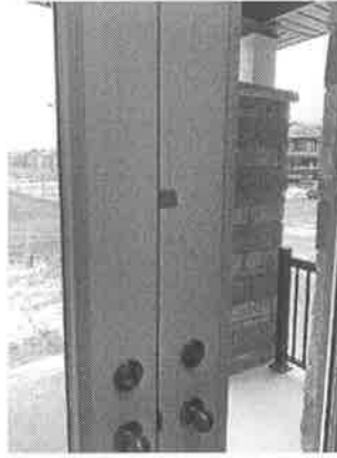
154076 - 3 - FRONT DOORS~CHIPS AT MIDDLE ASTRICAL AT FRONT DOOR