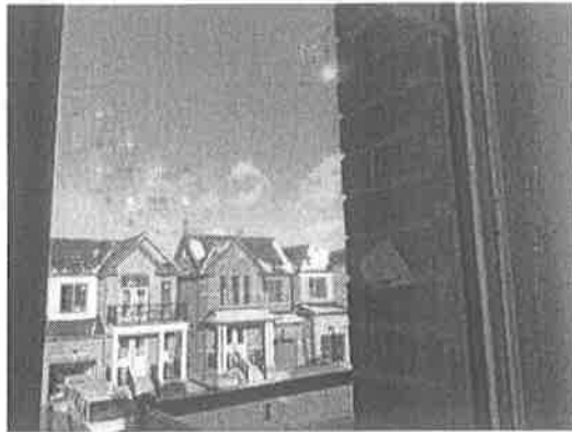
153390 - 2 - WINDOWS~SCRATCHES ON LEFT AND OPERATING WINDOW