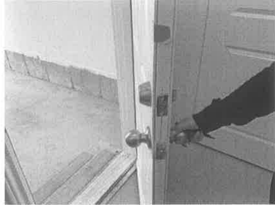
153389 - 1 - WINDOWS~SCRATCH AT OPERATING DOOR