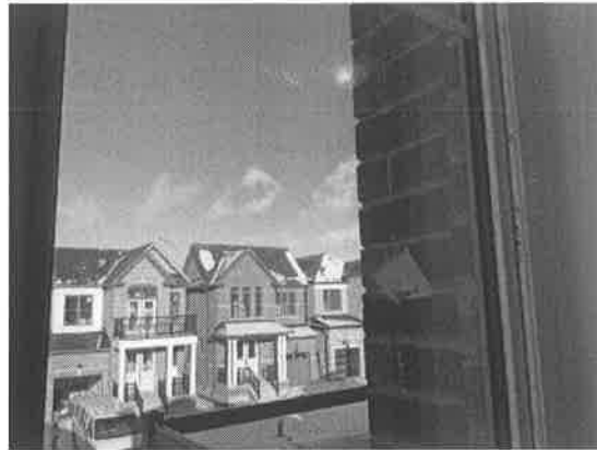
153390 - 2 - WINDOWS~SCRATCHES ON LEFT AND OPERATING WINDOW