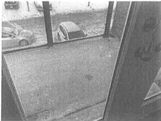
153390 - 1 - WINDOWS~SCRATCHES ON LEFT AND OPERATING WINDOW