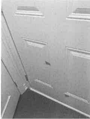
153386 - 1 - TRIM~CRACKED MAN DOOR AT HINGE