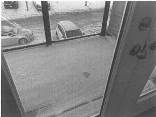
153390 - 1 - WINDOWS~SCRATCHES ON LEFT AND OPERATING WINDOW