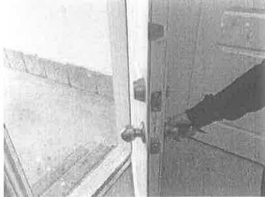
153389 - 1 - WINDOWS~SCRATCH AT OPERATING DOOR