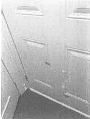
153386 - 1 - TRIM~CRACKED MAN DOOR AT HINGE