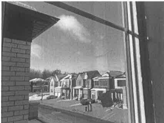
154554 - 1 - 2 - crack at operating window