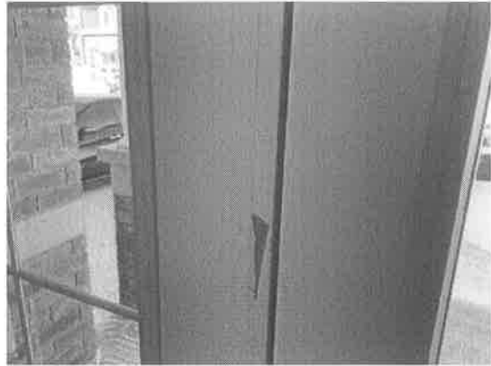
154238 - 3 - FRONT DOORS~CHIPPED ASTRICAL AT MIDDLE FRONT DOOR