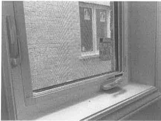
155717 - 1 - IMG_1878 - REMOVE BLACK PIECE FROM LEFT FIXED WINDOW