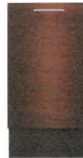
(Panel Ready) UDT518SAHP