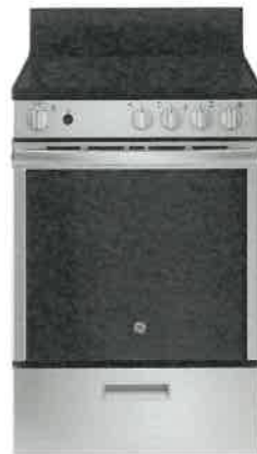
24" Range, Smooth top GE - JCAS640RMSS