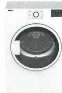
24" Dryer DV7600WW